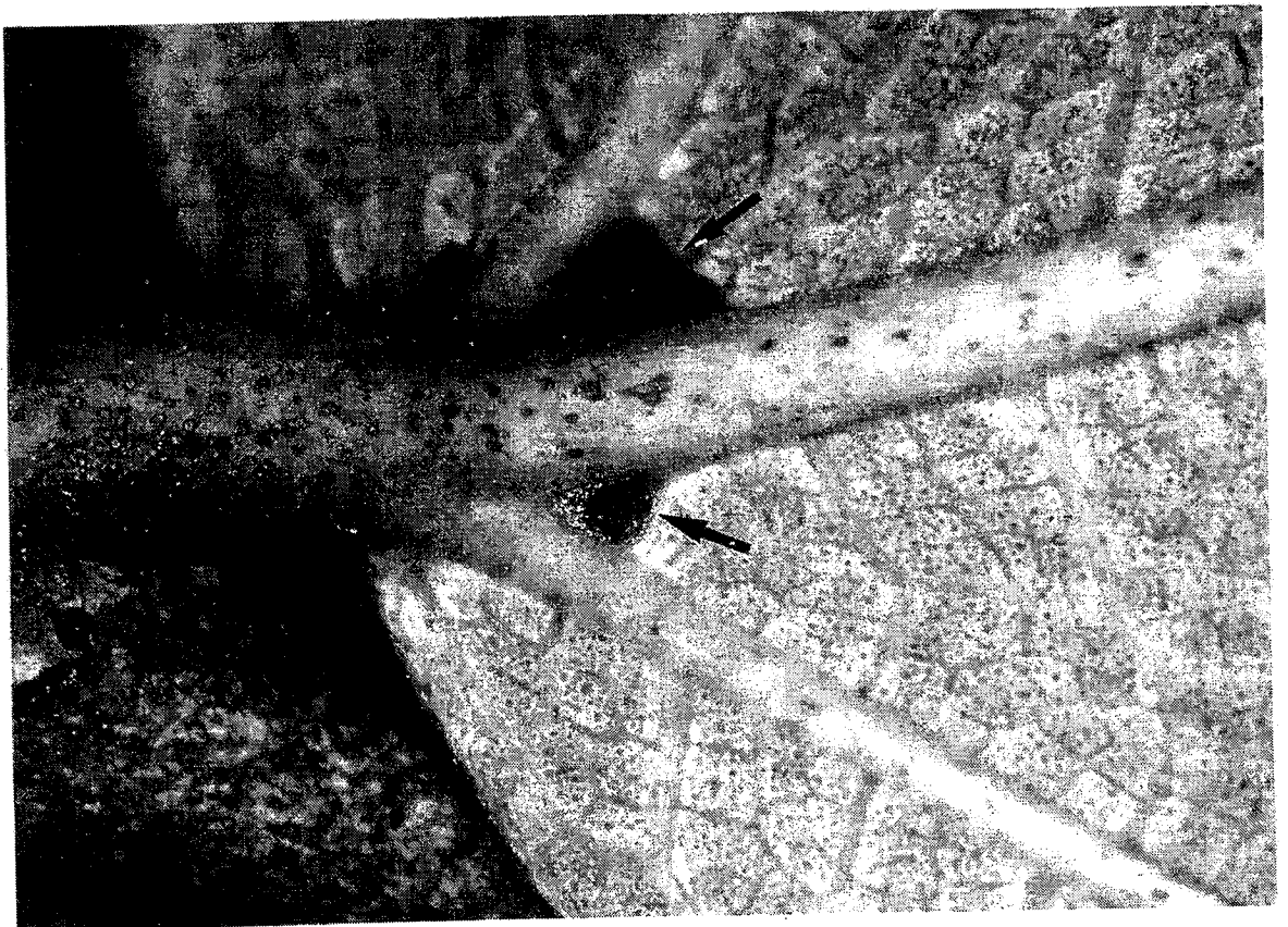
Figure 2: Extrafloral nectaries on the lower leaf surface between the midrib and side veins.

More than 20 other Malaysian fig species were examined in the field.